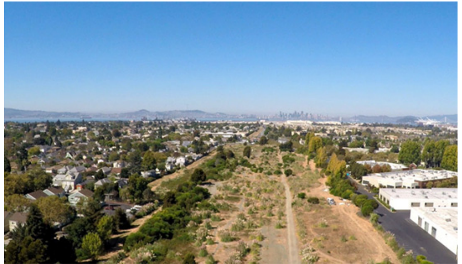
View of the Jean Sweeney Open Space Park, looking west toward San Francisco; a still photo from video shot in the Fall of 2016.

You can purchase any still image we create for you as a retouched, print quality digital file for $45.00 . These images, refined versions of raw still image project files, are licensed for non-profit personal, public, governmental, and education uses only. We will be glad to negotiate an editorial and retail license with you when the photos are to be used for commercial purposes.