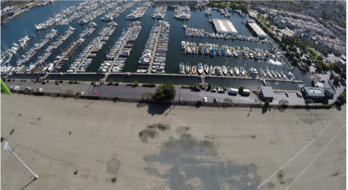
Yacht harbor at Encinal Terminal, viewed from the west, looking east. This photo was taken from drone video footage shot during the Fall of 2016.